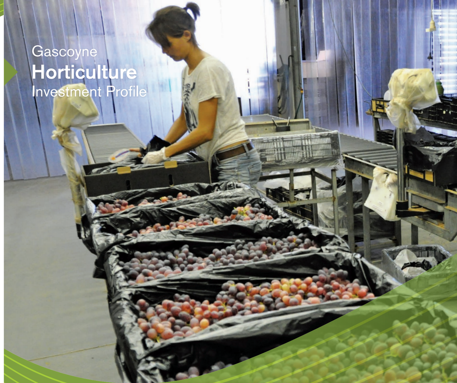
Tangelo Creative | GDC6014